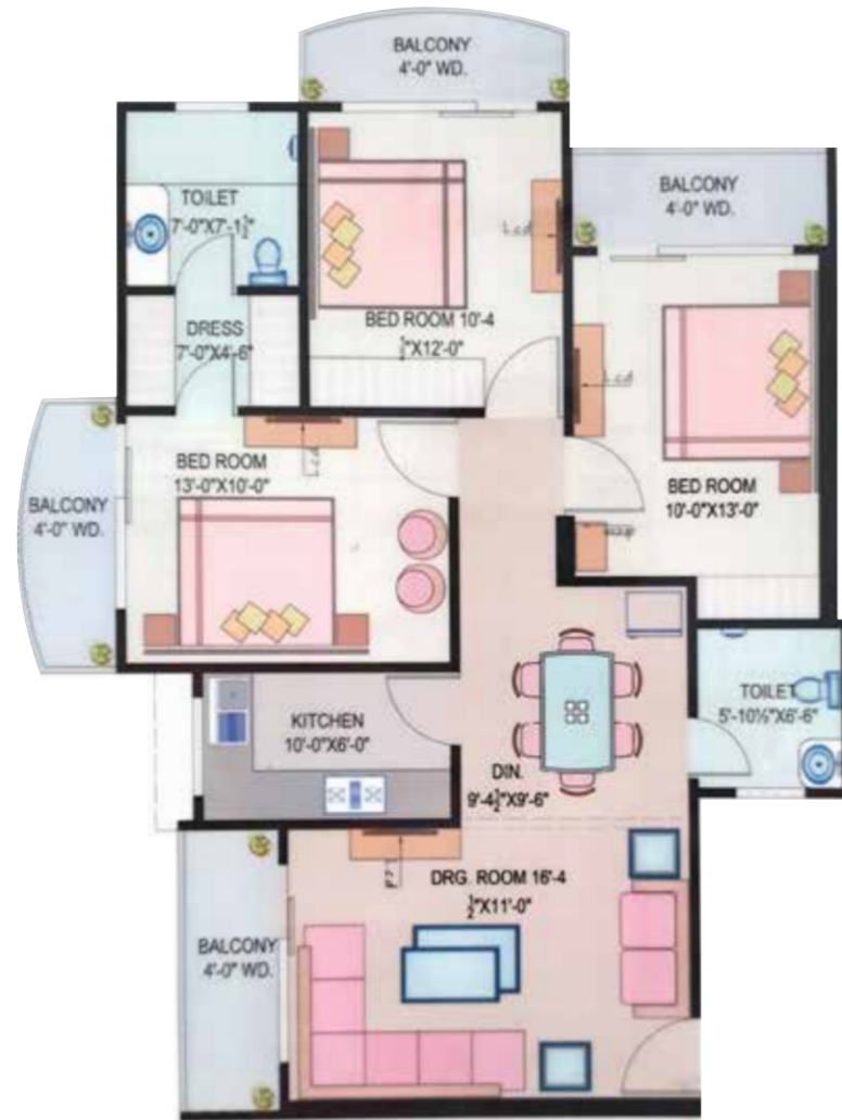
Type-1 Super Area 1465 SQ.FT. 3 BHK