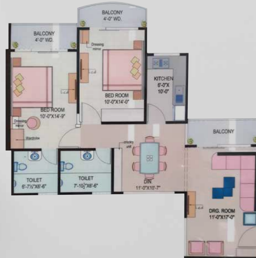
Type-2 Super Area 1225 SQ.FT. 3 BHK

A home is a dream come true and for most a lifelong investments. We have dreams and ideas of decorating and planning our homes in so many ways. We understand how your dreams and that's why have created homes that have enough space for your plans.