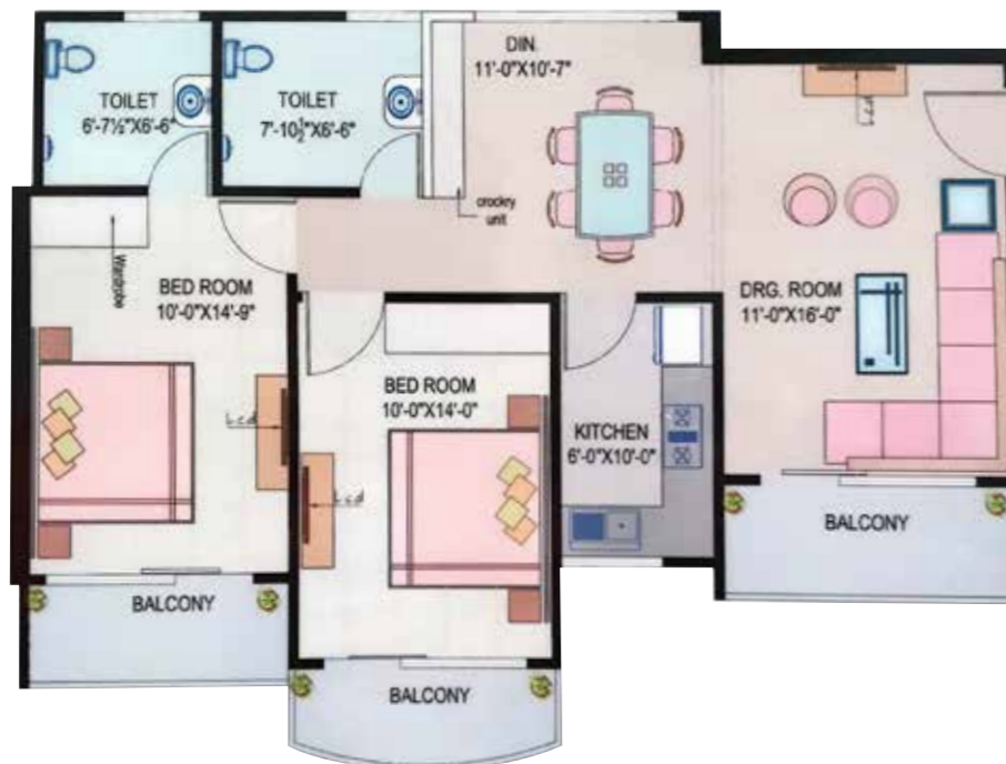
Type-3 Super Area 1200 SQ.FT. 2 BHK