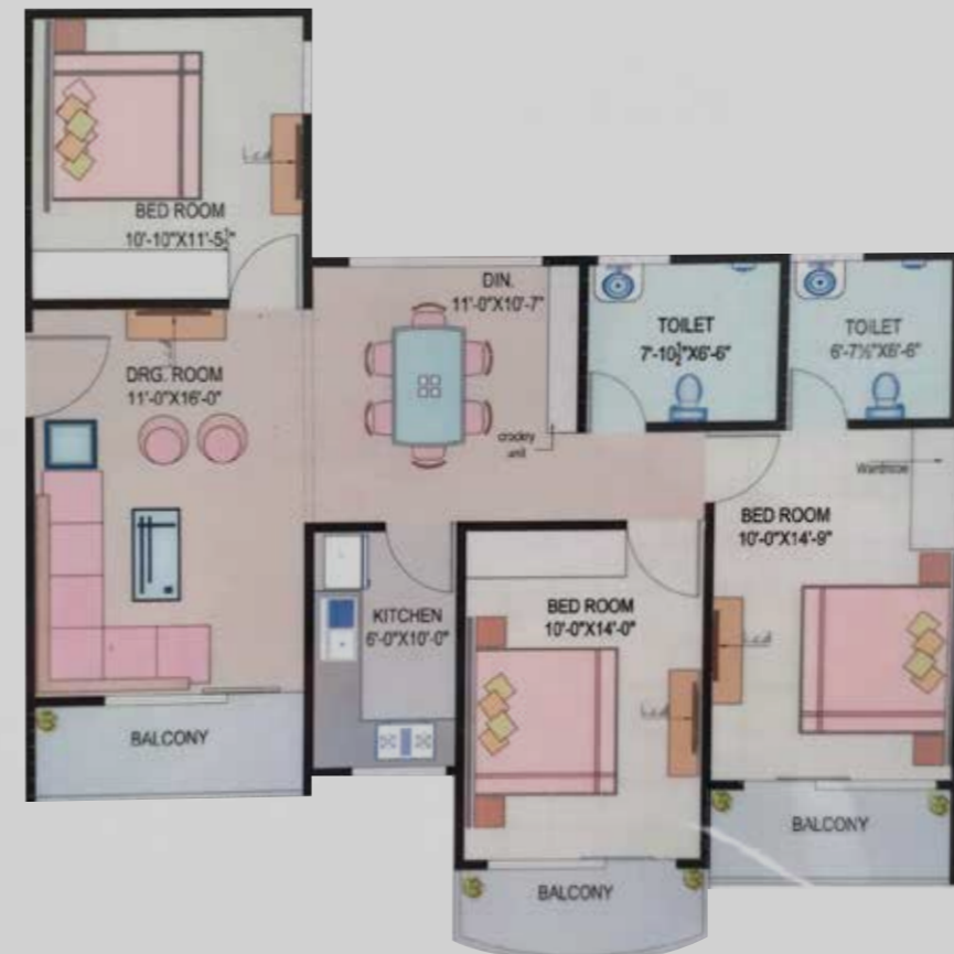
Type-4 Super Area 1375 SQ.FT. 3 BHK